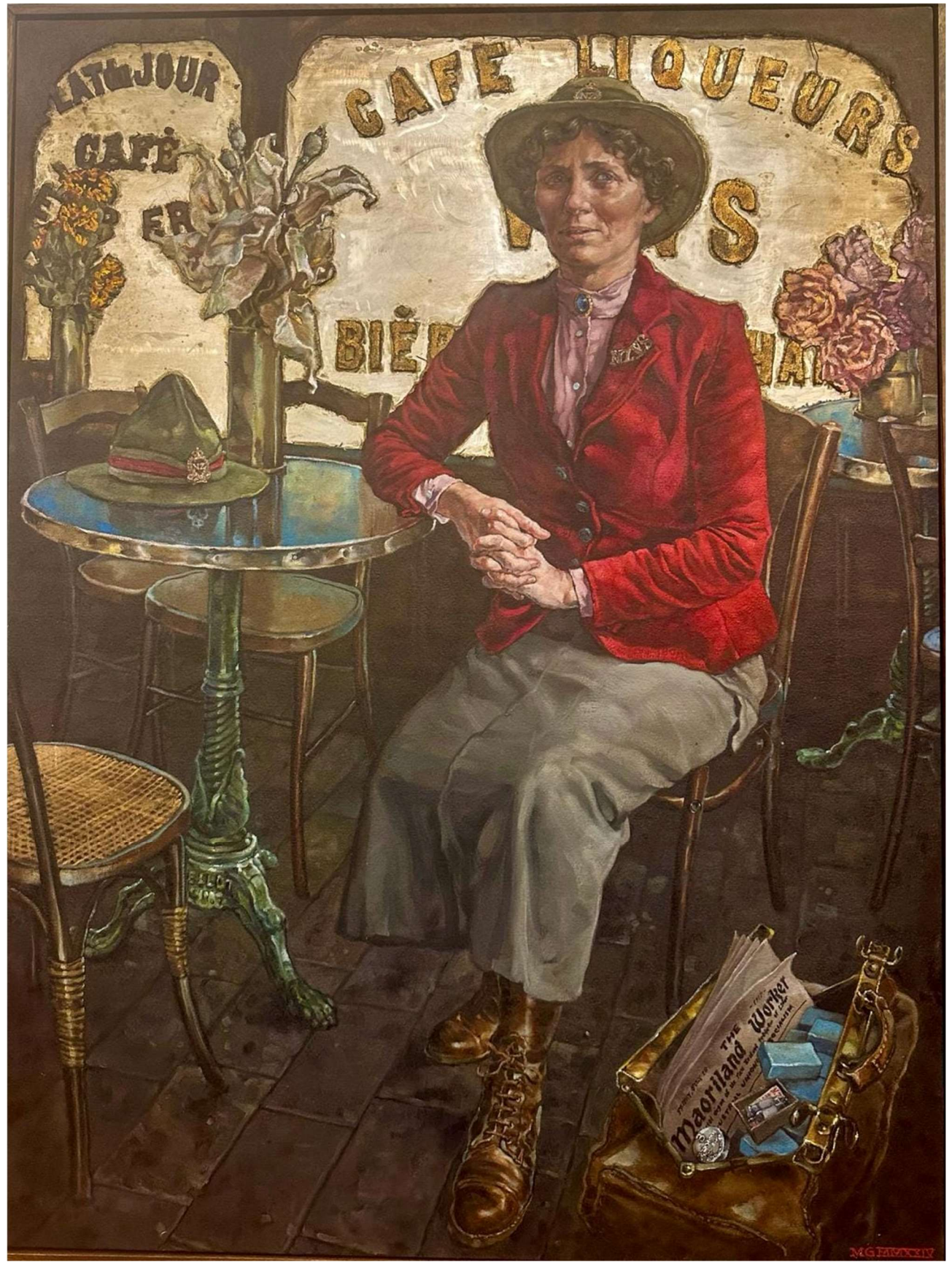
The portrait of Ettie Rout presented to Parliament.